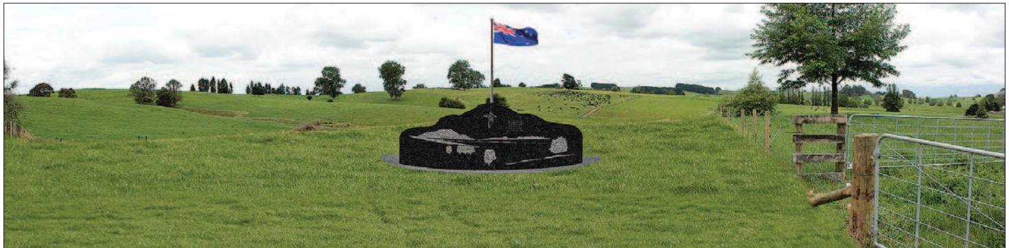
IMPRESSION of Tokanui Hospital Cemetery with Memorial Wall and flagpole installed and new grass.